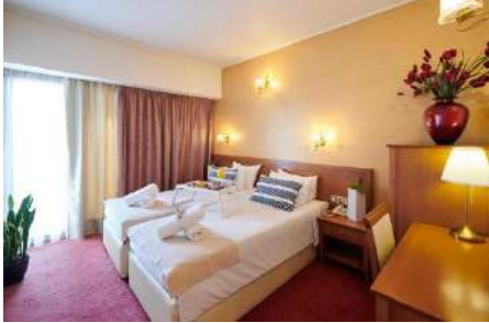
Crystal City Hotel

Athens – Crystal City / Jason Inn / Dorian Inn or similar