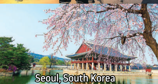
Seoul, South Korea