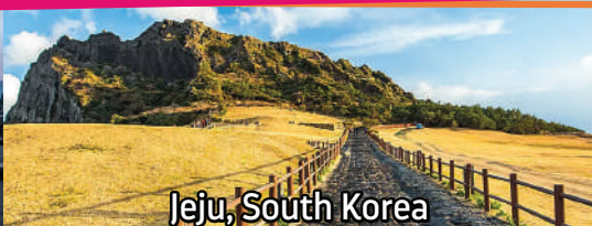
Jeju, South Korea